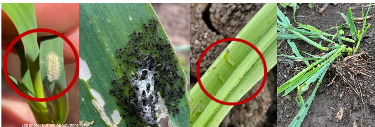
Left to right: egg mass, hatched larvae and windowing, unroll leaves to find small larvae, plants lopped by larger larvae.